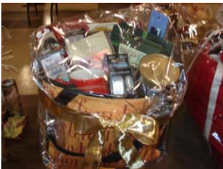
Book Lover's Basket (Barnes & Noble Bag)