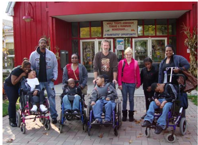
Classroom 3 enjoying a picture perfect moment at Lake Farm Park.

Lisa attended an Ed. Leadership Conference, "Inclusion Works!", in Columbus in September. Julie attended an Autism Spectrum workshop at Kent State this past June.