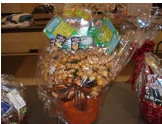
Lottery chances surrounded by beautiful flowers beacon a winner