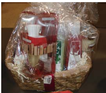
The ESC's Board donated a Bath and Body Works basket that contained several fragrances and items.