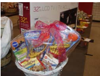
Fall Family Fun basket beside the very popular 32" LCD TV